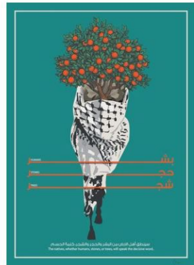
The Orange Tree by Issam Al-Haj Ibrahim