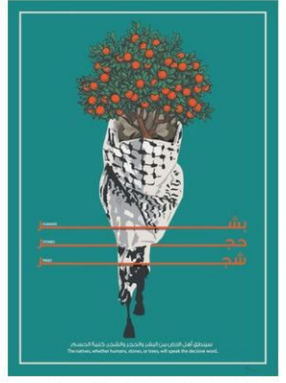
The Orange Tree by Issam Al-Haj Ibrahim